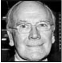
SPEECH: Sir Ming

Musharraf was set to meet President George Bush in the US today.